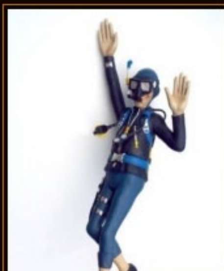
Funny Scuba Diver £525.00 Plus VAT Life Size