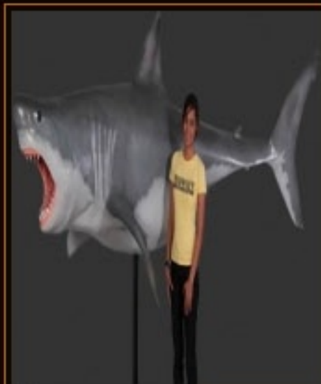
Great White Shark £1200.00 Plus VAT Life Size