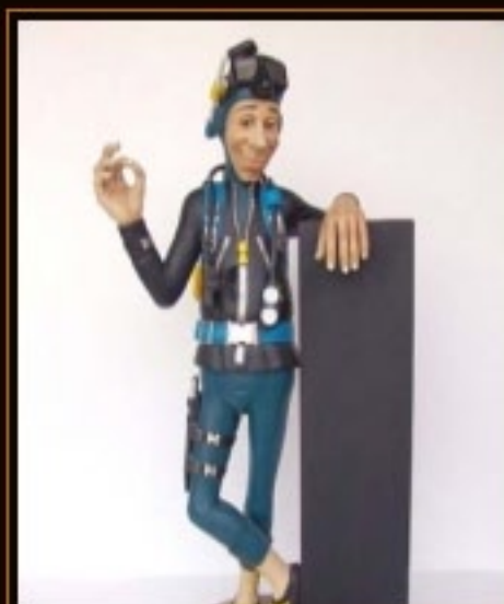
Funny Scuba Diver £525.00 Plus VAT Life Size