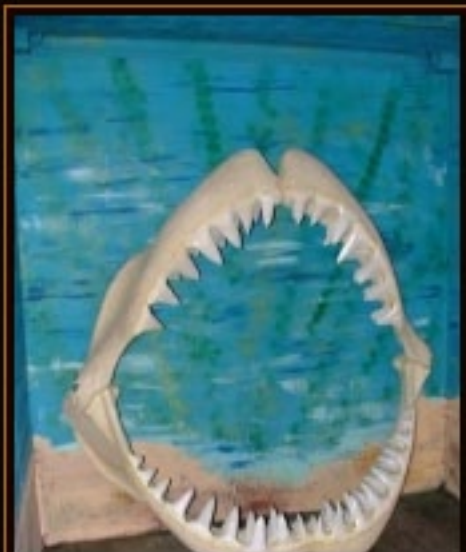
Shark Jaws Large £399.00 Plus VAT