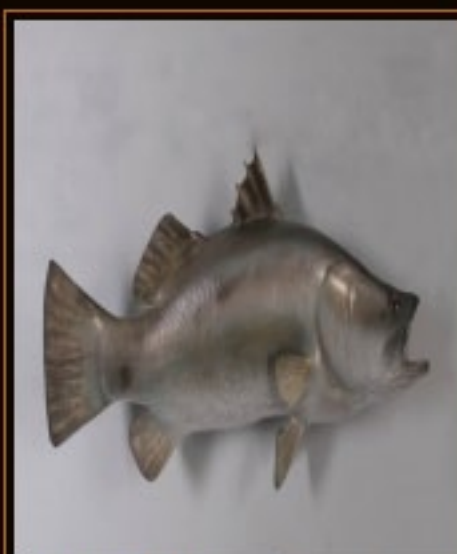
Barramundi £169.00 (JR ... Plus VAT