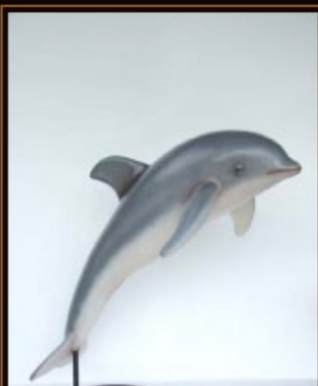
Dolphin on £395.00 stand ... Plus VAT