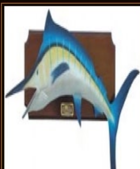
Blue Marlin £199.00 Mounted ... Plus VAT