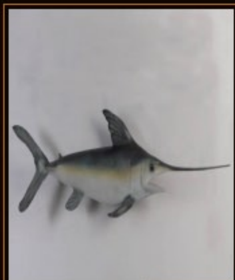
Broad Billed ... £169.00 ... Plus VAT