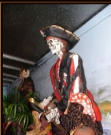
Figure Head - ... £399.00 ... Plus VAT