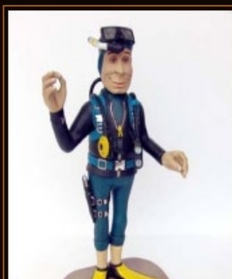
Funny Scuba Diver £169.00 Plus VAT