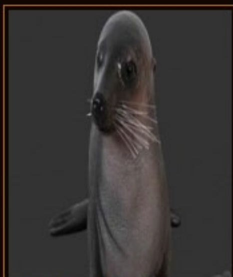
Baby Fur Seal £169.00 (JR ... Plus VAT