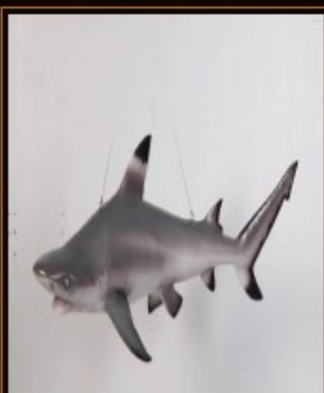
Black Tip Reef £169.00 ... Plus VAT