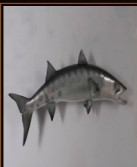
Barracuda (JR ... £169.00 ... Plus VAT