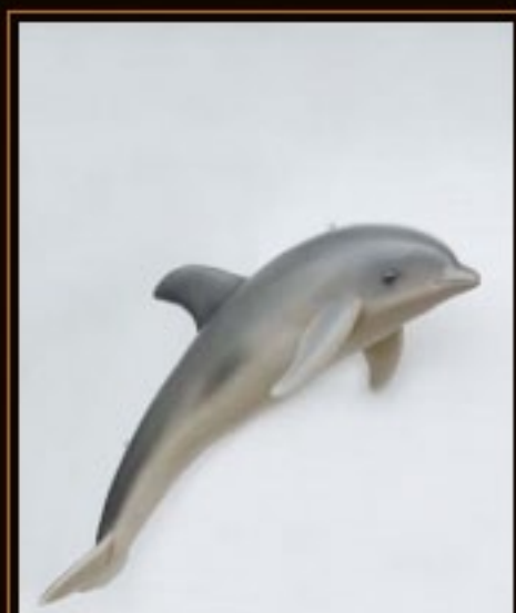
Dolphin £395.00 hanging (JR ... Plus VAT