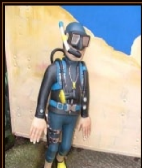
Funny Scuba Diver £169.00 Plus VAT