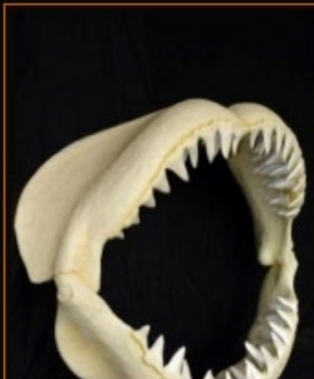
Shark Jaws Medium £225.00 Plus VAT