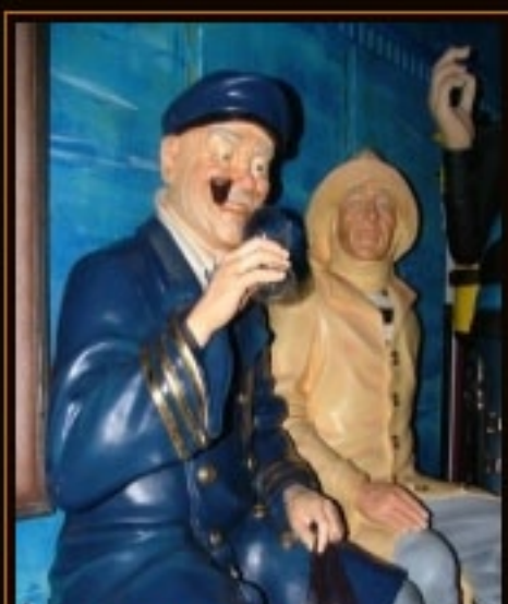
Seated Old Sea £525.00 Plus VAT Life Size