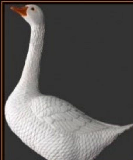
Goose (JR 080045) ... £169.00 Plus VAT