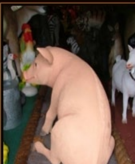
Piglet sitting ... £169.00 Plus VAT