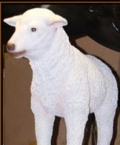
Lamb life-size (JR ... £95.00 Plus VAT