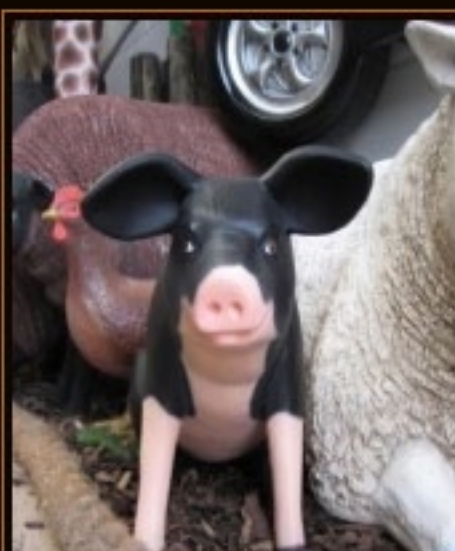
Pig Pink & Black ... £89.00 Plus VAT