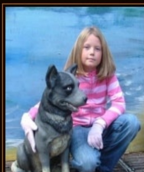
Sheep-Dog £169.00 sitting ... Plus VAT