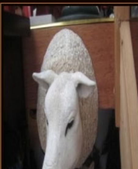
Texelaar Sheep Head ... £89.00 Plus VAT