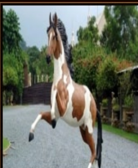
Indian Horse with ... £1200.00 Plus VAT