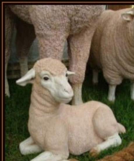
Sheep Merino £89.00 Lamb - ... Plus VAT