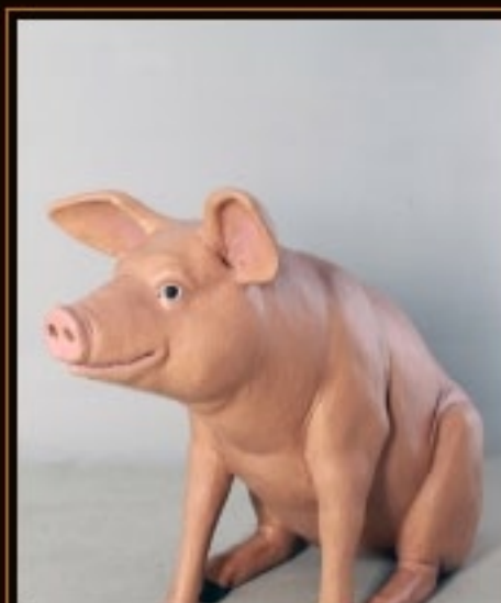
Large Pig Sitting - ... £199.00 Plus VAT