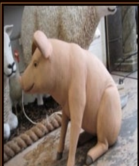
Pig Pink Sitting £89.00 - ... Plus VAT