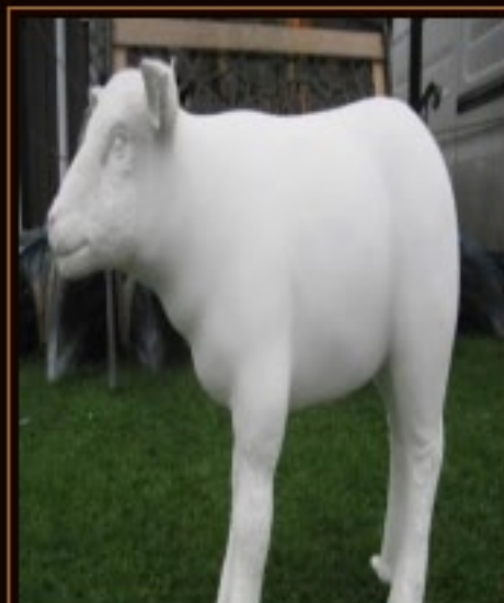
Texelaar Lamb £130.00 - ... Plus VAT