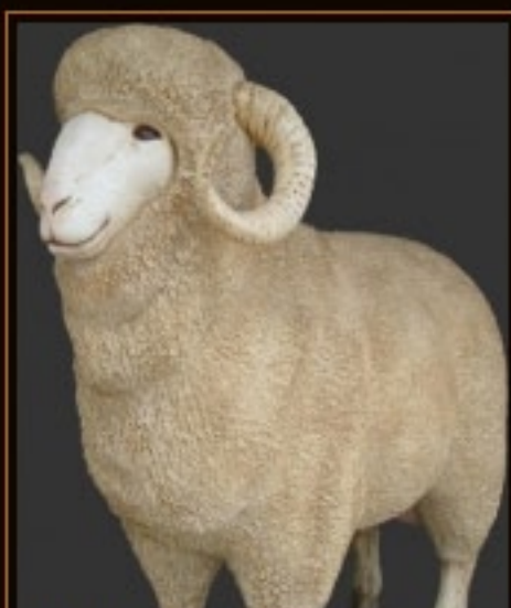
Merino Ram £240.00 (JR ... Plus VAT