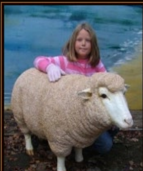
Sheep Merino £199.00 Ewe ... Plus VAT