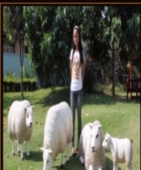
Texelaar Sheep £625.00 Plus VAT