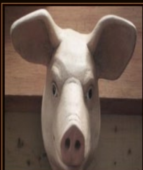
Pig Head (JR 0027) ... £89.00 Plus VAT