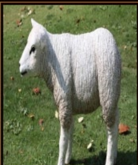
Texelaar Lamb £169.00 (JR ... Plus VAT