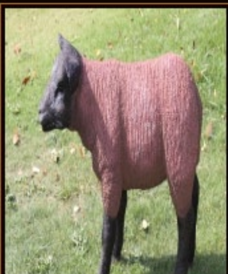
Texelaar Lamb £169.00 (JR ... Plus VAT