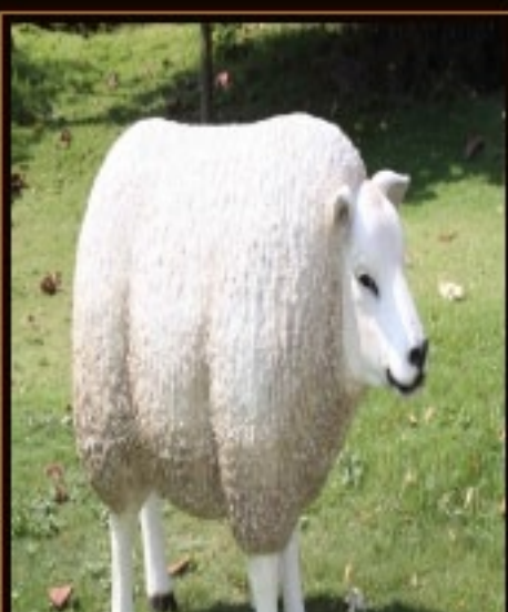
Texelaar Sheep Head ... £199.00 Plus VAT