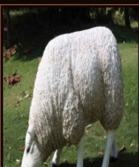
Texelaar Sheep Head ... £199.00 Plus VAT