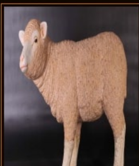
Sheep Merino £169.00 Lamb ... Plus VAT