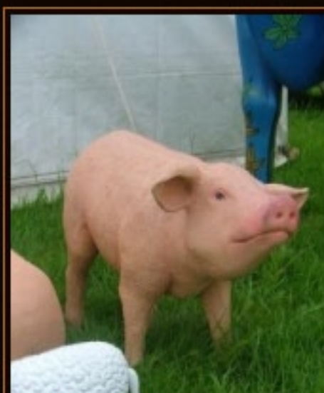
Piglet standing £169.00 (JR ... Plus VAT