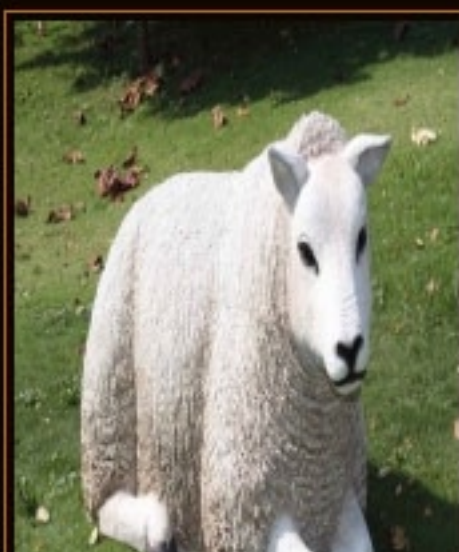
Texelaar Sheep £199.00 Plus VAT