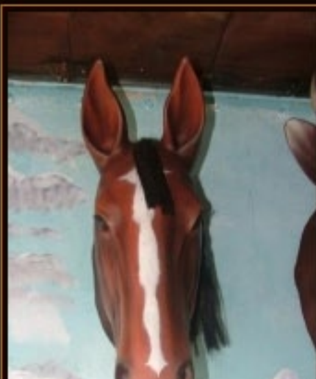
Horse Head (Resin) ... £169.00 Plus VAT