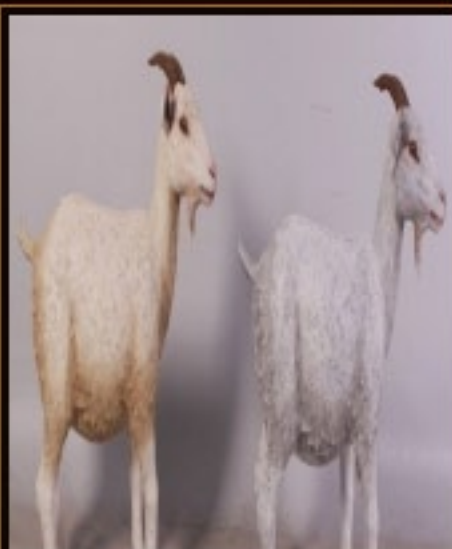
Goat - Cream (JR ... £169.00 Plus VAT