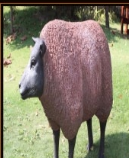
Texelaar Sheep Head ... £199.00 Plus VAT