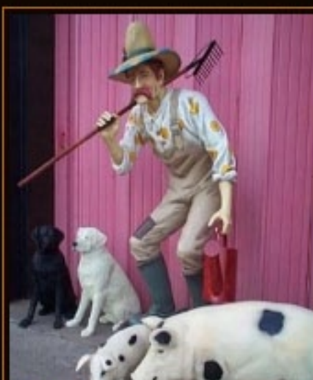
Old Man Gardener ... £525.00 Plus VAT Life Size