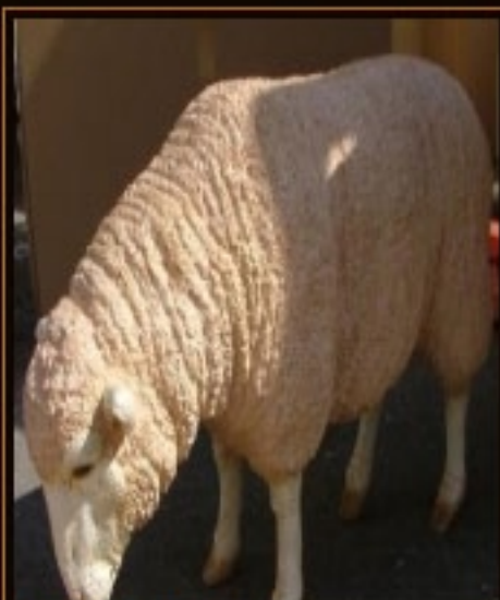
Sheep Merino £199.00 Head ... Plus VAT