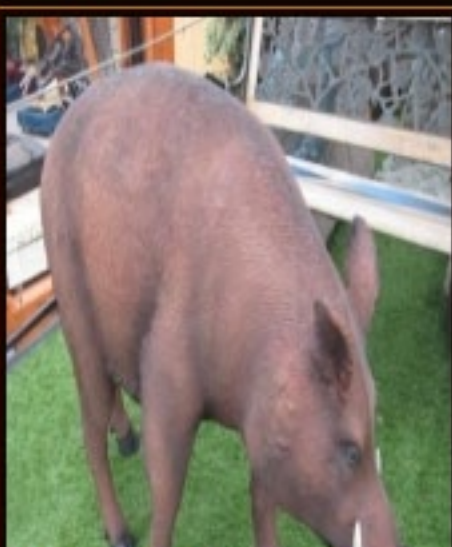
Wild Boar (JR ... £199.00 Plus VAT