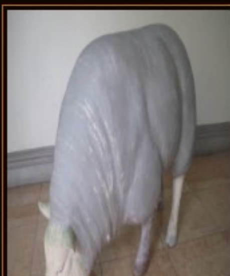
Texelaar Sheep Head ... £199.00 Plus VAT