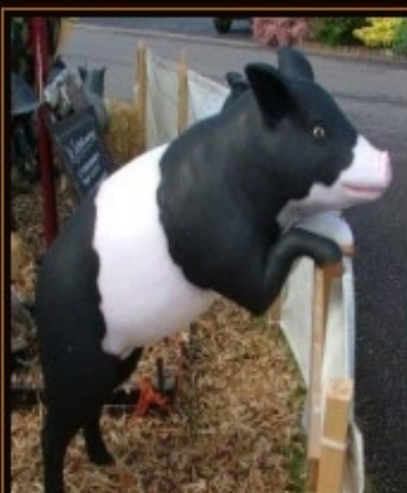
Pig 53" long £240.00 (JR ... Plus VAT