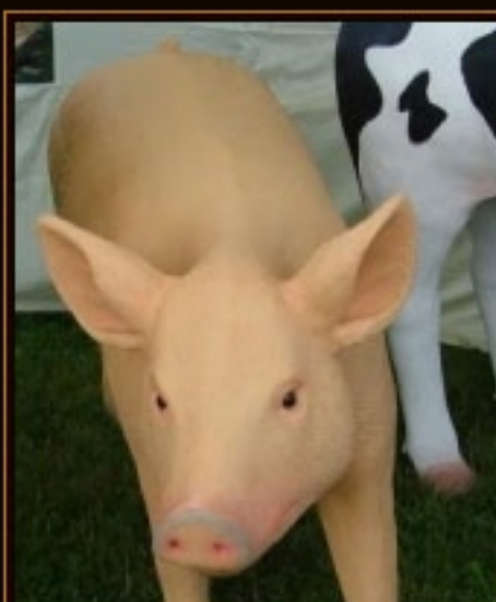
Pig life-size (JR ... £240.00 Plus VAT