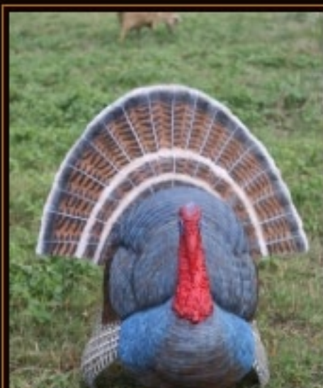
Wild Turkey (JR ... £255.00 Plus VAT