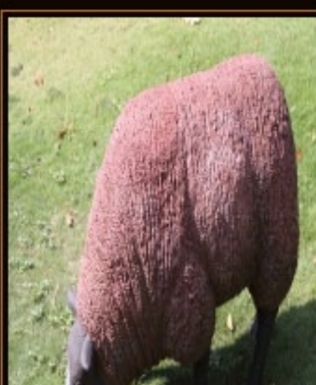
Texelaar Sheep Head ... £199.00 Plus VAT