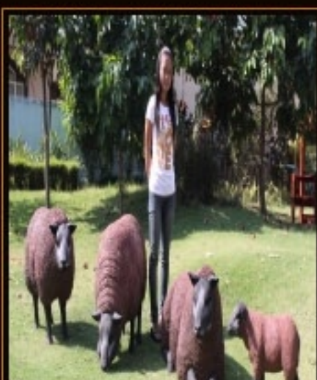
Texelaar Sheep £625.00 ... Plus VAT