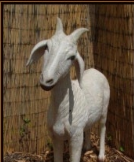
Goat life-size (JR ... £199.00 Plus VAT